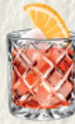
NEGRONI Gin · Vermouth · Bitter