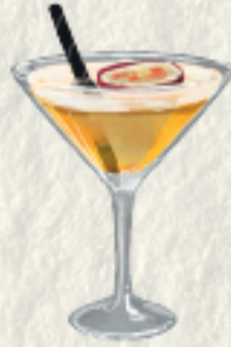
PORNSTAR MARTINI Vodka · Passion Fruit · Lime · Vanilla