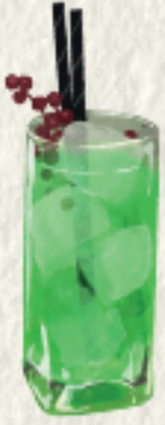
★ RAMUNE HAI Ramune · Shochu