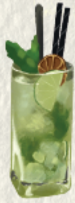
MOJITO Rum · Lime · Mint