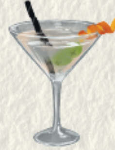
SAKETINI Sake · Dry Gin · Olive