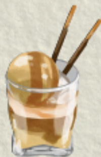
AFFOGATO ICE LATTE